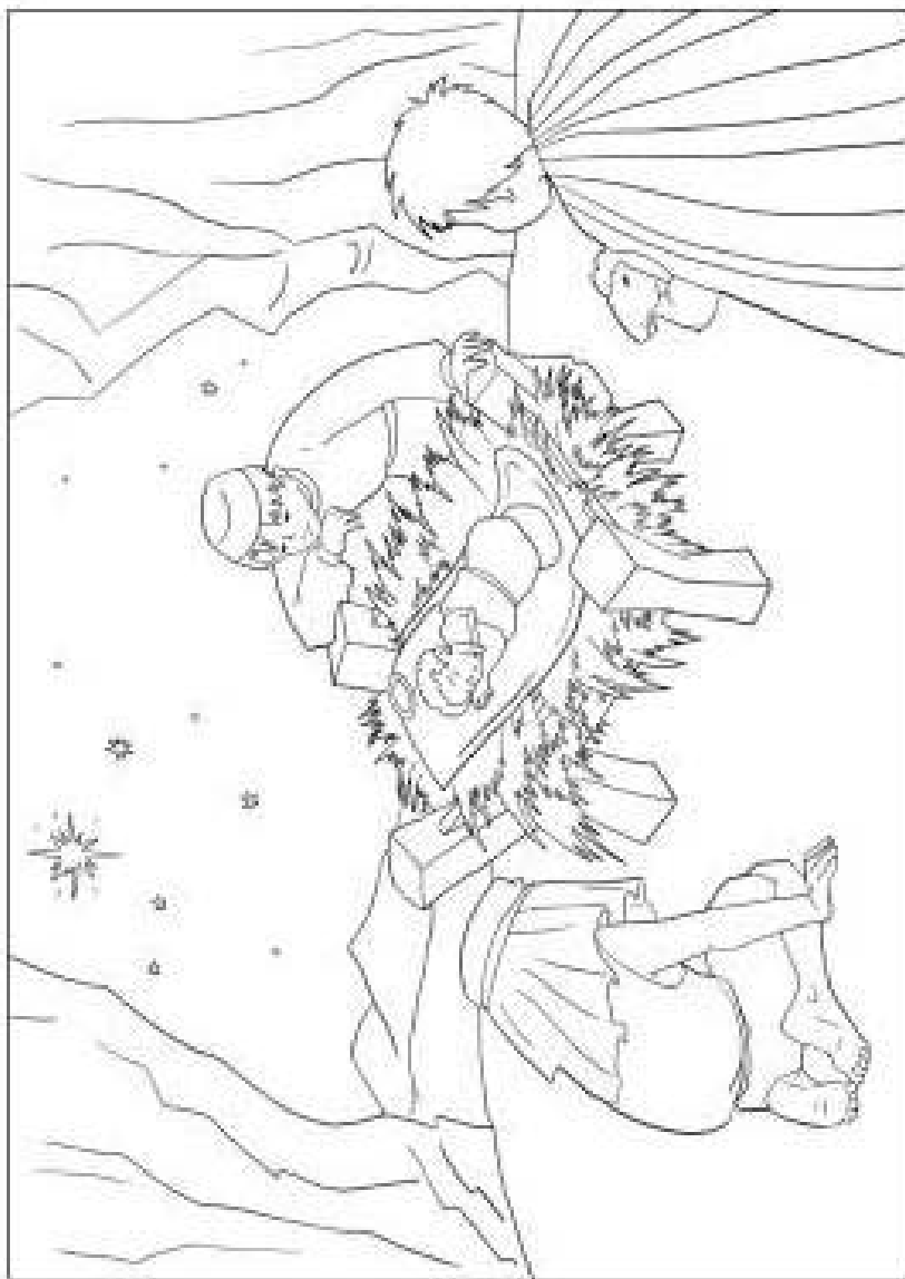
The shepherds visit the baby Jesus